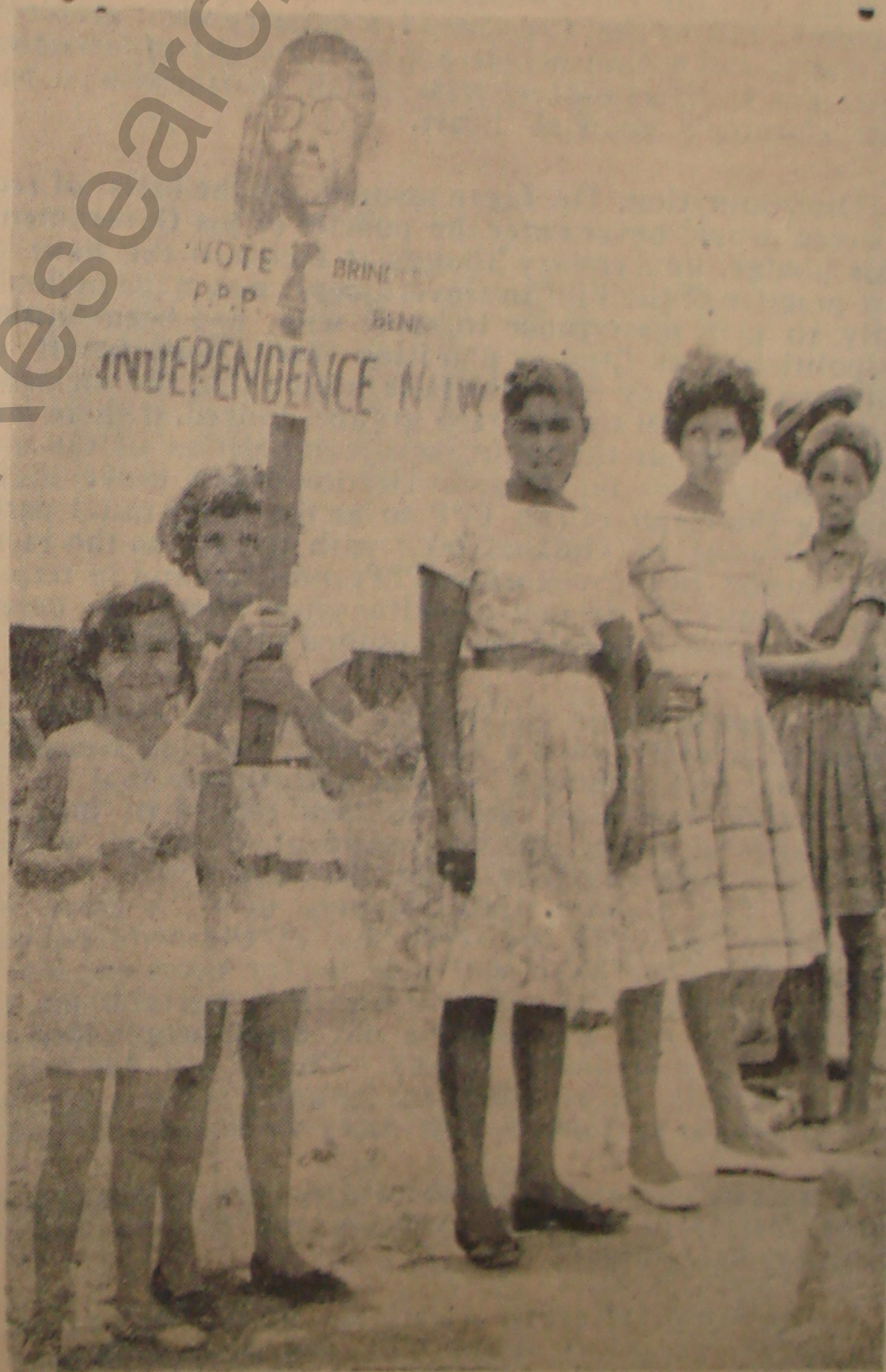
Party Chairman B.H. Benn's photo is proudly borne by these youngsters as they awaited the victory motorcade on the East Coast road.

Vol. 12 No 35 Saturday SEPT, 2, 1961 British Guiana Price 8 cents